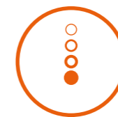
Risk of Falls