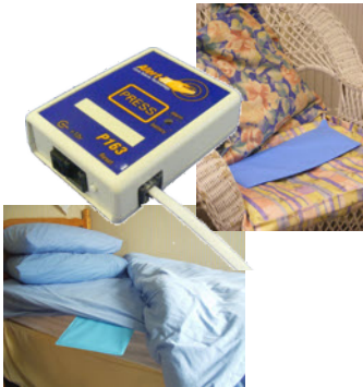
Bed or Chair leaving