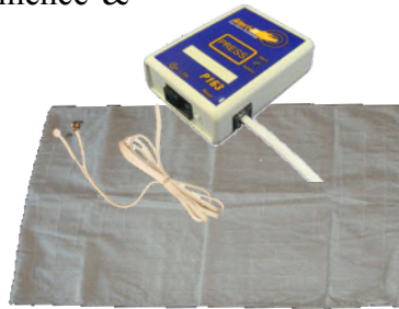
Incontinence & Vomit